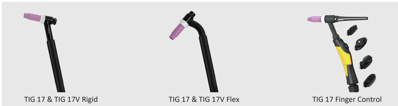
TIG 17 & TIG 17V Rigid